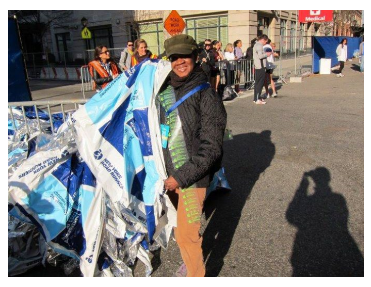
VOLUNTEER READY TO DISTRIBUTE PRE-SEPARATED HEATSHEETS