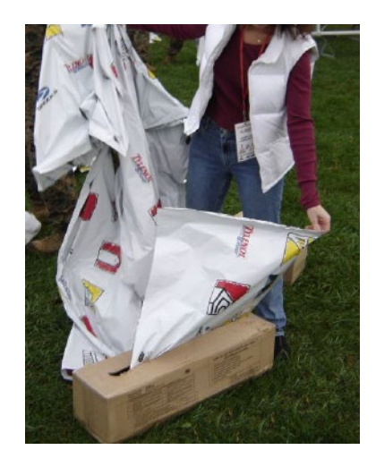
PULLING HEATSHEETS FROM DISPENSER