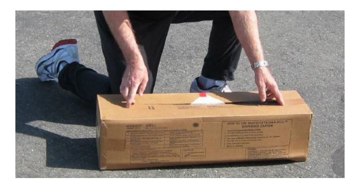
OPENING THE DISPENSER CARTON